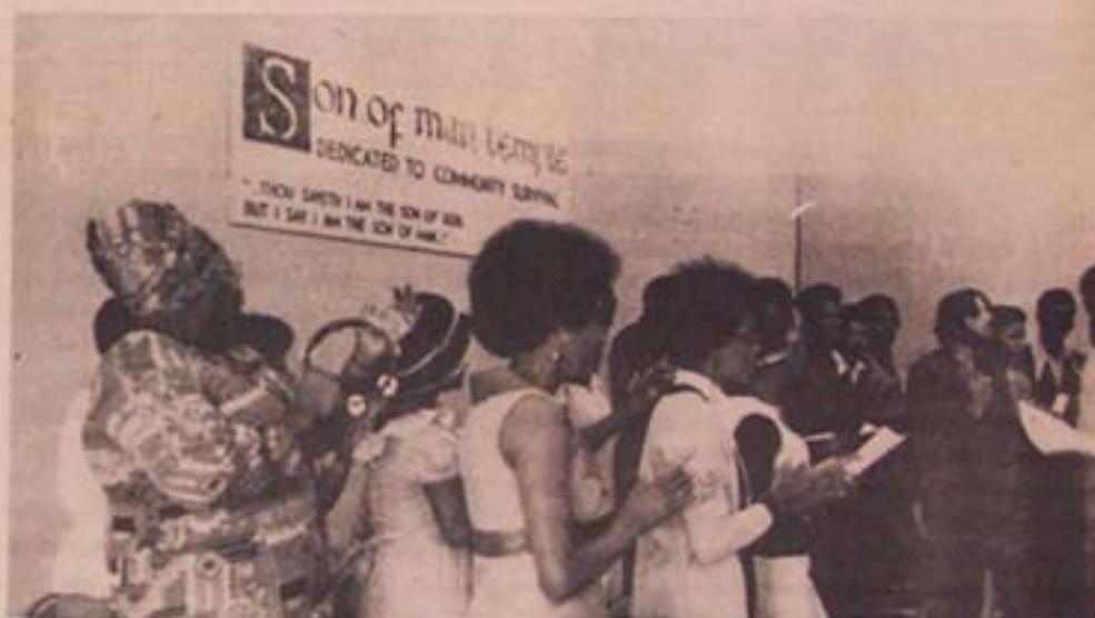
Son of Man Temple Choir singing the old gospel hymn, "We Shall Not Be Moved."