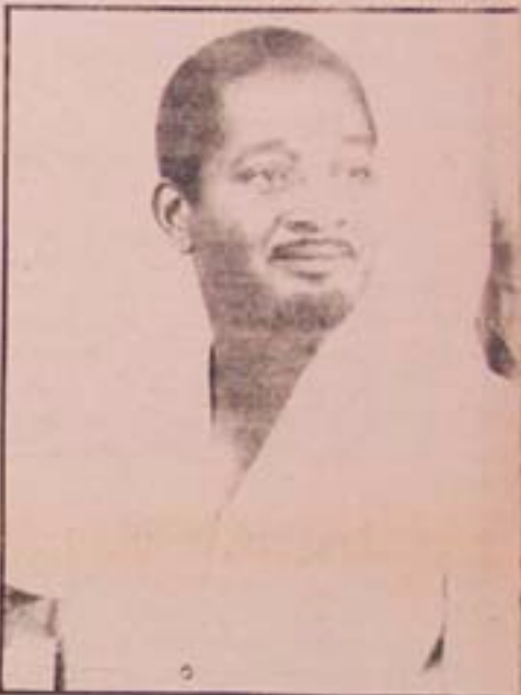
Prime Minister FORBES BURNHAM of Guyana.

through the jungle and opened the first highway to Brazil. More of the country's children are in school, and the Curriculum Development Center of the Ministry of Education is doing pioneer work in producing its own supplementary books, with an accent on Guyanese history, for the schools.