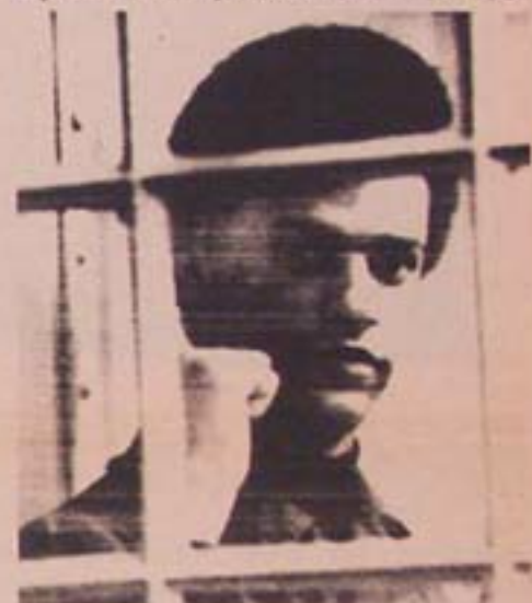
HUEY P. NEWTON found true freedom behind bars.

Over a span of time - I do not know how long it took - I mastered my thoughts. I could start them and stop them; I could slow them down and speed them up. It was a very conscious exercise. For a while, I feared I would lose control, I could not think; I could not stop thinking. Only later did I learn through practice to go at the speed I wanted. I call them film clips, but they are really thought patterns, the most vivid pictures of my family, girls, good times. Soon I could lie with my back arched for hours on end, and I placed no importance on the passage