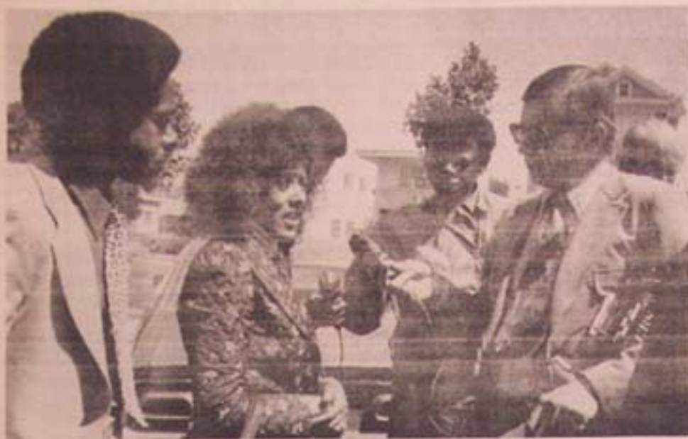
ELAINE BROWN and BOBBY SEALE announced the Black Panther Party's plans to boycott six Oakland Safeway stores.