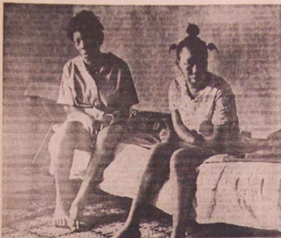
Minnie, 14, (left) and Mary Relf, 12.