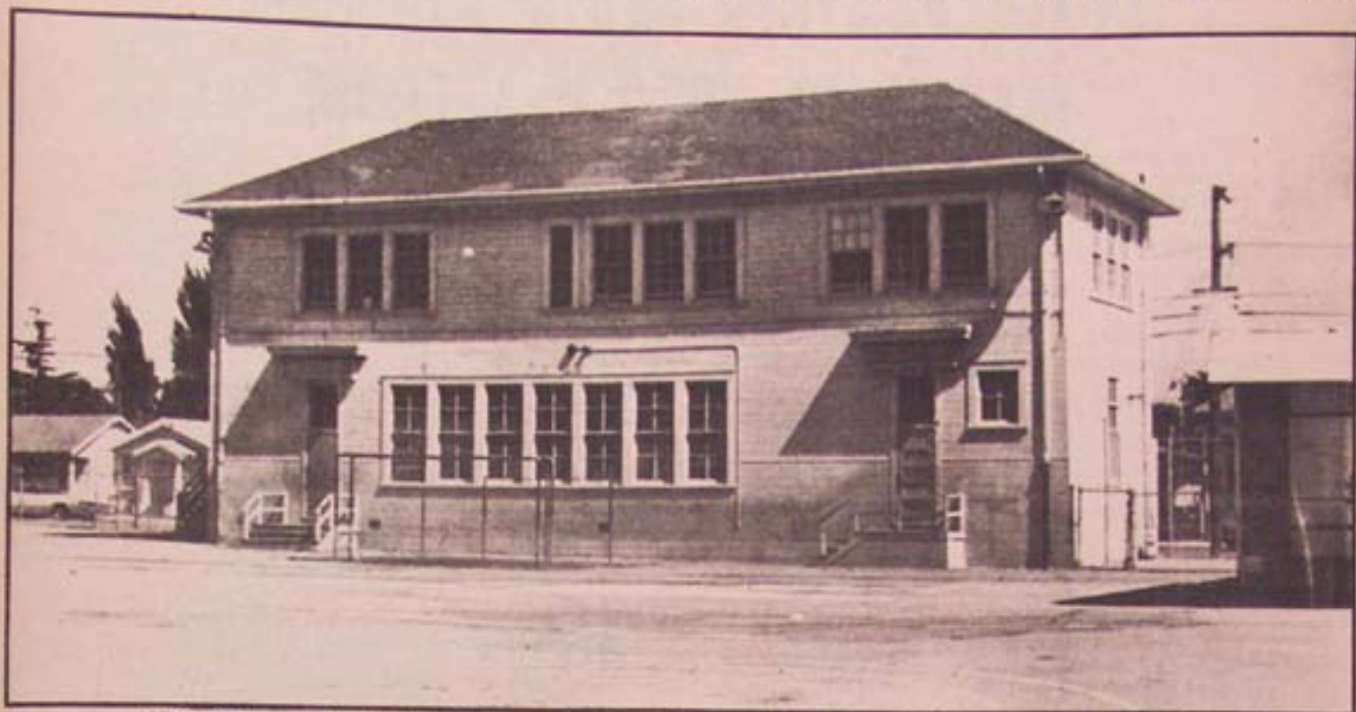
Highland Elementary School (shown above) is only one of Oakland's dilapidated schools in need of funds. The School Board, however, has developed a new program which not only overlooks these obvious needs but, in essence, overlooks our school children as well.

1973. This was accomplished, but parental involvement is yet to be realized.